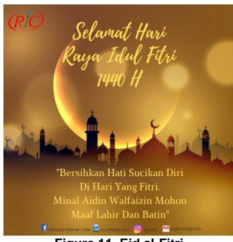
Figure 11. Eid al-Fitri

Figure 10 This poster design is a medium used to welcome the birthday of Pancasila which falls on June 1.