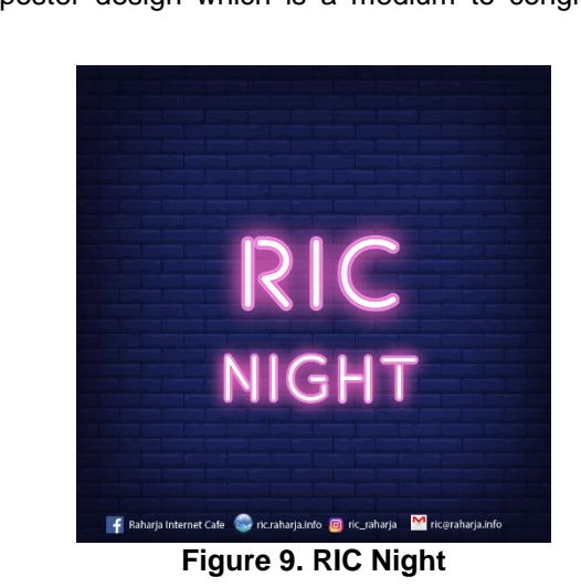
Figure 9 This poster design is a medium for delivering information about activities taking place at Raharja Internet Cafe (RIC) and in the poster provides information that Raharja Internet Cafe will be open until 9 pm.