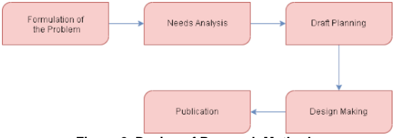
Figure 2. Design of Research Methods

In a study needed research methods used to achieve goals and obtain information that is acceptable and accurate that is needed by the author. The following is the design of the research method used in this study: