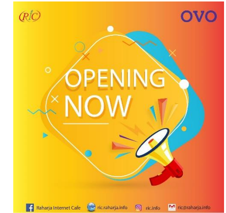
Figure 7. RIC collaboration with OVO

Figure 6 is a promotional media such as certain events that took place at Raharja Internet Cafe (RIC) and in the poster gives the event period to be held, namely OVO Promo Rp. 1K.