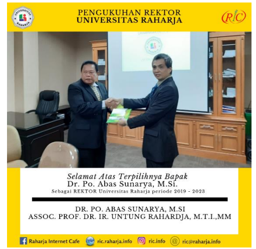
Figure 5. Inauguration of Raharja University Chancellor

Figure 4 is a poster design that is a medium to welcome the coming of the holy month of Ramadan, and congratulation fasting to the whole community especially private Raharja, for the poster size is 640px X 640px which will be posted on social RIC Media.