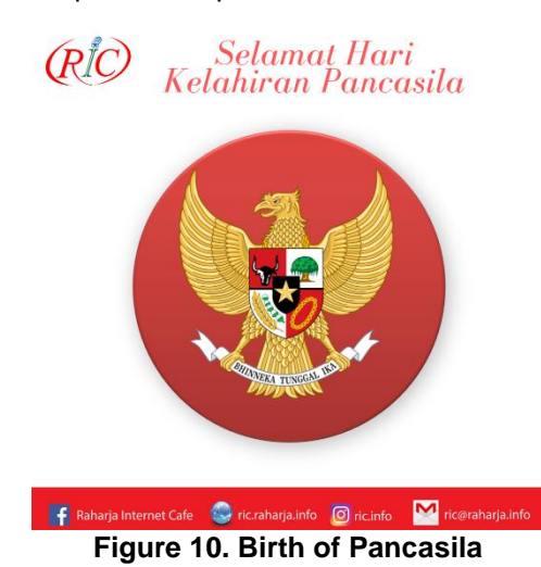
Figure 10 This poster design is a medium used to welcome the birthday of Pancasila which falls on June 1.

Figure 9 This poster design is a medium for delivering information about activities taking place at Raharja Internet Cafe (RIC) and in the poster provides information that Raharja Internet Cafe will be open until 9 pm.