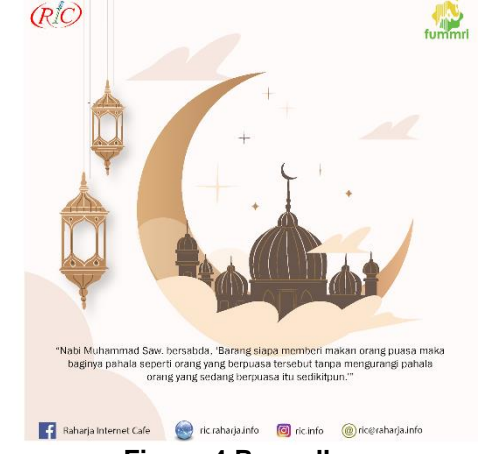
Figure 4 Ramadhan

Figure 3 is a poster design of OVO 1k promo information which will be at Raharja Internet Cafe (RIC), for the poster size of 640px X 640px which will be posted on RIC social media.