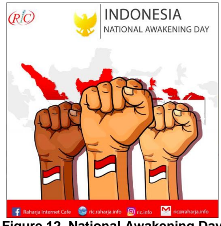
Figure 12. National Awakening Day

Figure 12 This poster design is a medium used to welcome National Awakening Day which falls on May 20th.